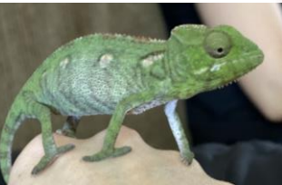
Chameleon and Lemur that we saw.