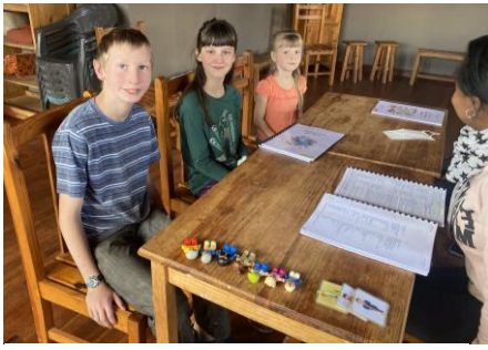
Top: kids in language class. Bottom: visiting the "Rova" the king's palace