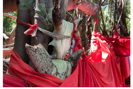
(above) Fetishes on a "sacred" tree