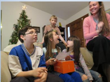
The kids excited to find out that we are expecting!