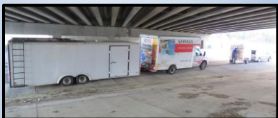
Our 75 foot moving caravan