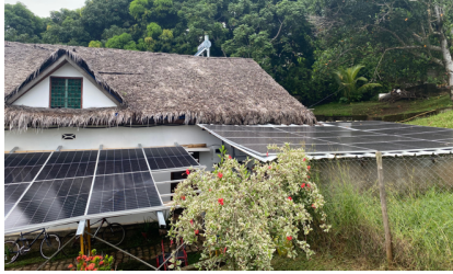
What do these have in common?